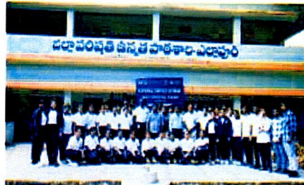
reach efforts in Yellapur Village. The initiative aims to foster the true spirit of "Not Me, But You", inspiring students to embrace social responsibility, leadership, and community service through hands-on participation in rural development activities.