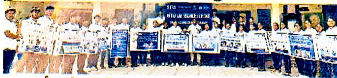
ఫైక్వీలతో ఎస్సార్ విశ్వ విద్యాలయం విద్యార్థులు, అధ్యాపకులు

హనువల్లి, న్యూస్టుడే: అసంత సాగర్ శివారు ఎస్సార్ విశ్వ విద్యాలయానికి చెందిన ఎన్ఎస్ఎస్ వాలం